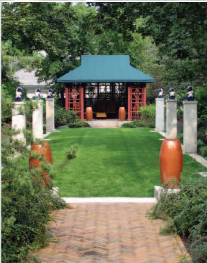
The McKenna Garden in Evanston, IL, welcomed Open Days guests.