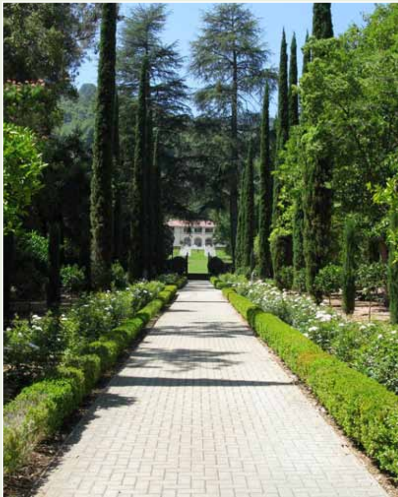
A view down the allée in the Italianate garden at the Montalvo Arts Center in Saratoga, CA.