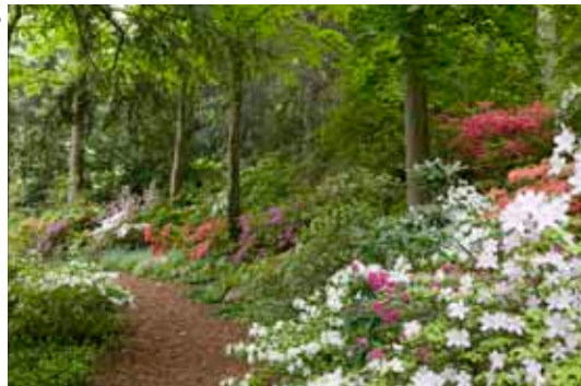
Chelsea Strickel/Garden Design

Public access in the future will be limited much as it is now: to designated open days, visits