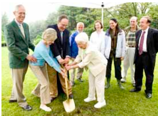
Trustees of Greenwood Gardens break ground on the first phase of restoration.