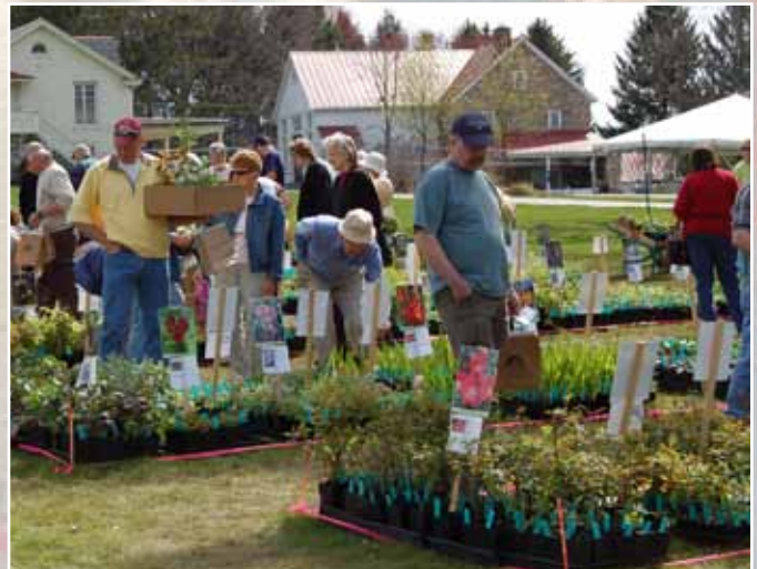
Open Days visitors at Burpee’s Fordhook Farm enjoyed a plant sale.