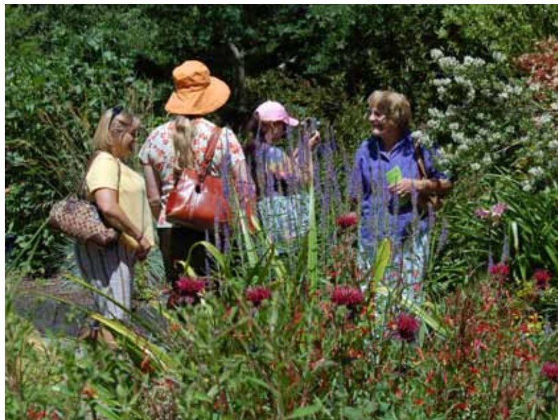
Above: A colorful Open Day scene at Heronswood in Kingston, WA.

Participation in our 2009 Open Days Program has been gratifying, particularly in this time when Americans are making studied choices about allocating their time and resources. This enthusiasm is one measure of the too often unsung important place gardens have in our personal and cultural life.