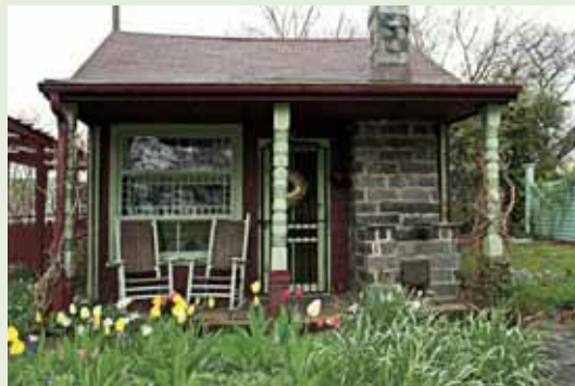
Anne Spencer's writing cottage overlooks the garden.

Learn more about Anne Spencer and her house and garden at www.annespencermuseum.com .