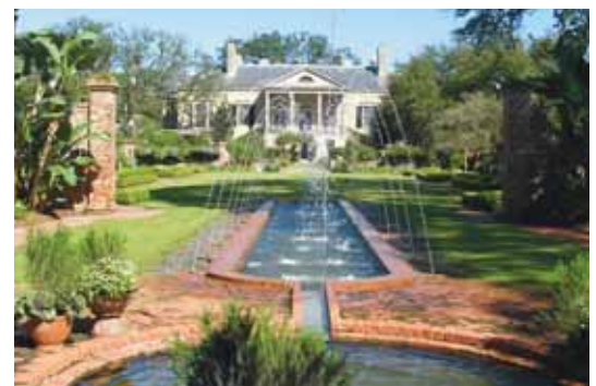
The plantings of Longue Vue's restored Spanish Court have recaptured its original character.

Heritage Landscapes is a woman-owned professional firm with offices and staff in Vermont, Connecticut, and North Carolina. Since 1987 they have specialized in projects focusing on culturally valuable landscapes.