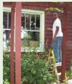
A fresh coat of paint is one result of a board work day in May.