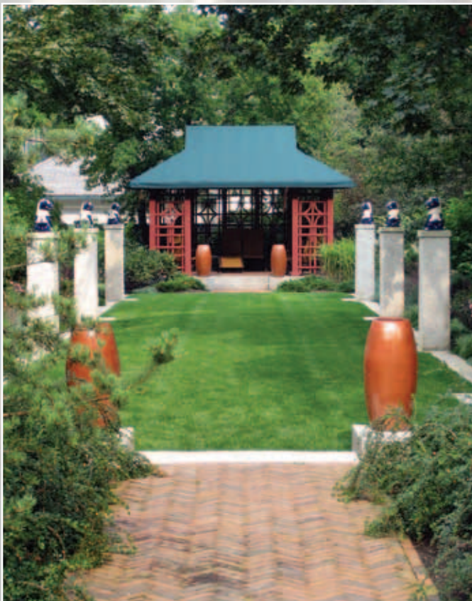
The McKenna Garden in Evanston, IL, welcomed Open Days guests.